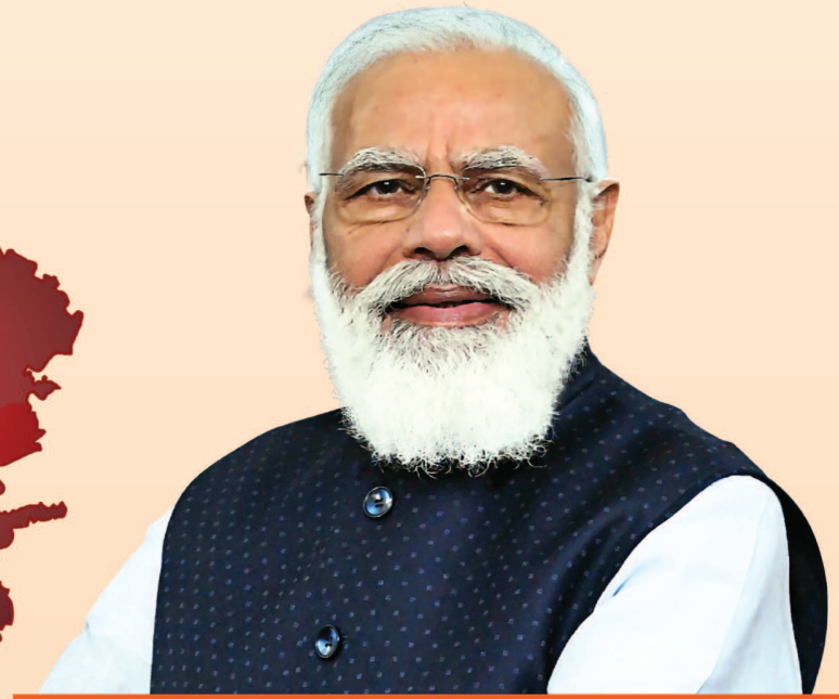
Shri Narendra Modi Hon'ble Prime Minister of India