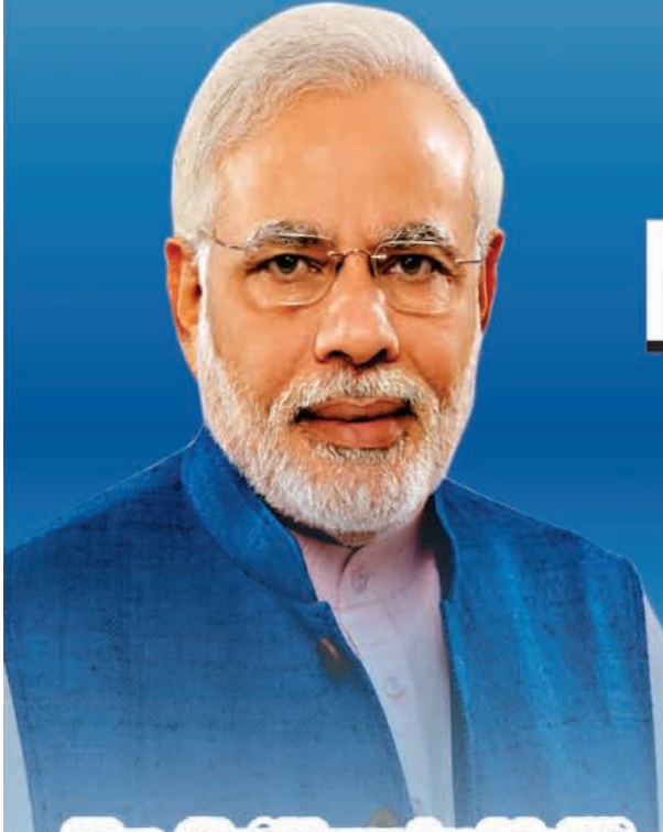
Hon. Shri Narendra Modi Prime Minister of India