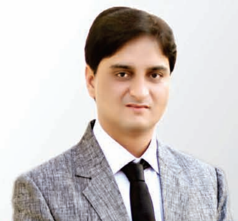
SHRI DIXIT PATEL Chariman - Jay Jalaram Education Trust

Minister - Human Resource Development Government of India