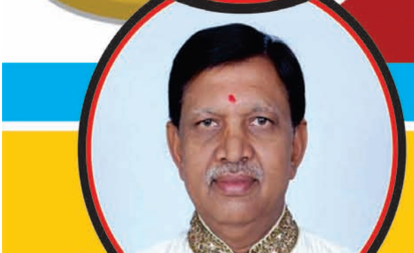
Hon. Shri Chhatrasinhji Mori Minister of State Food & Civil Supplies, Consumer Affair, Govt. of Gujarat