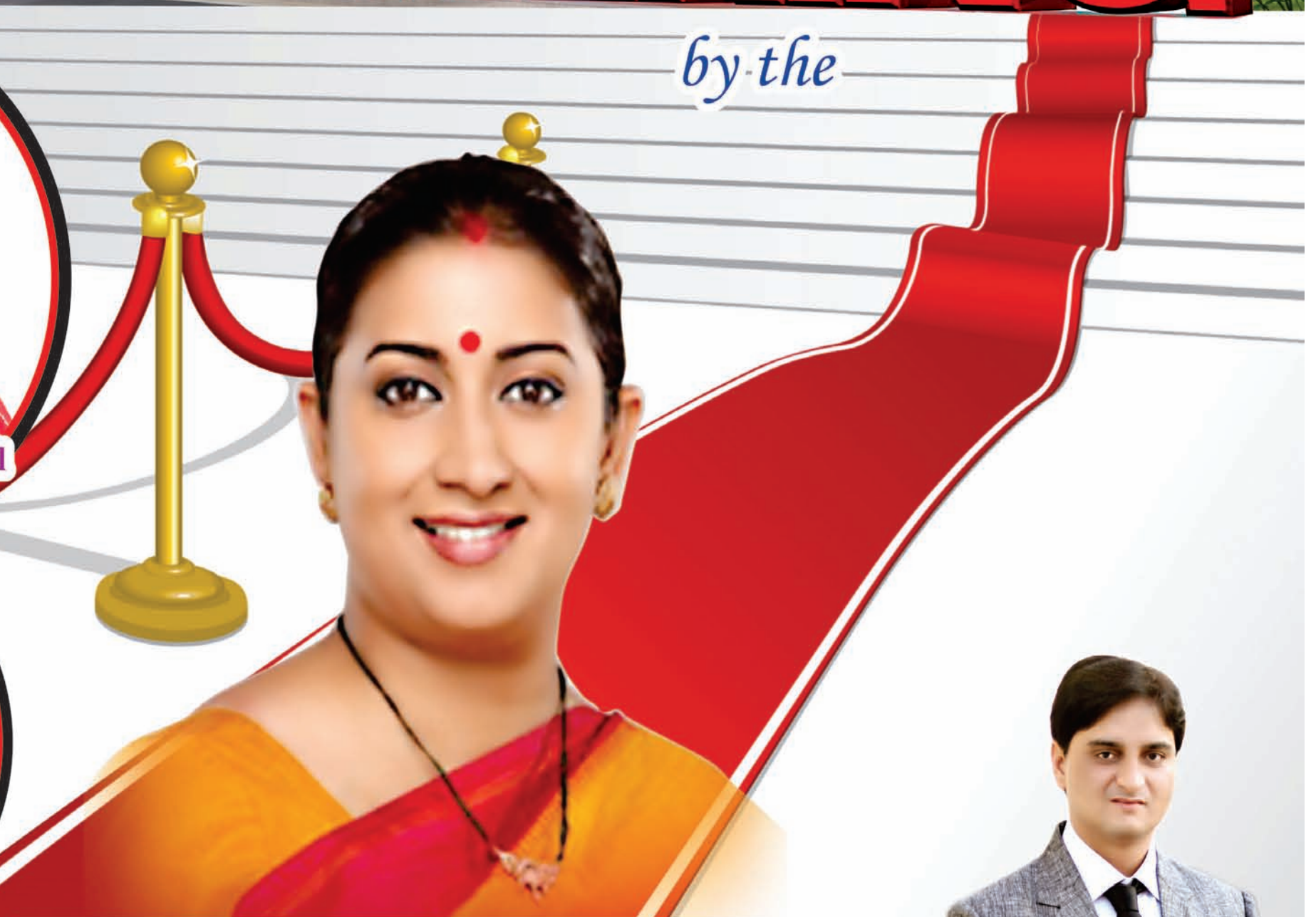
Hon. Smt. Smriti Zubin Irani

Minister - Human Resource Development Government of India