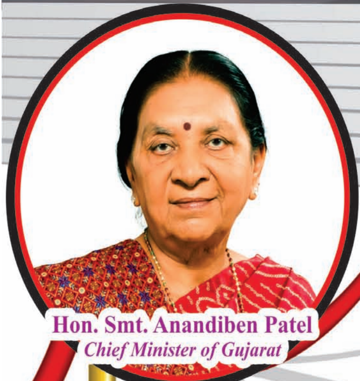
Hon. Smt. Anandiben Patel Chief Minister of Gujarat